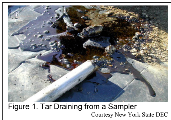
Figure 1. Tar Draining from a Sampler

The bedrock is fractured and is a productive aquifer. The overburden in the upper terrace is entirely above groundwater. In the lower terrace, groundwater is found in the overburden, and fluctuates with the tide, indicating some hydraulic communication between the river and the groundwater.