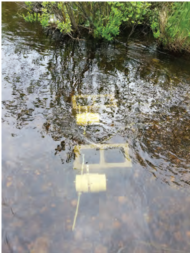
The polar organic chemical integrative sampler (POCIS) and semipermeable membrane device (SPMD), and replicate, deployed at the U.S. Geological Survey streamgage North Branch Au Sable River at The Ford Road near Lovells, Michigan (04135765).