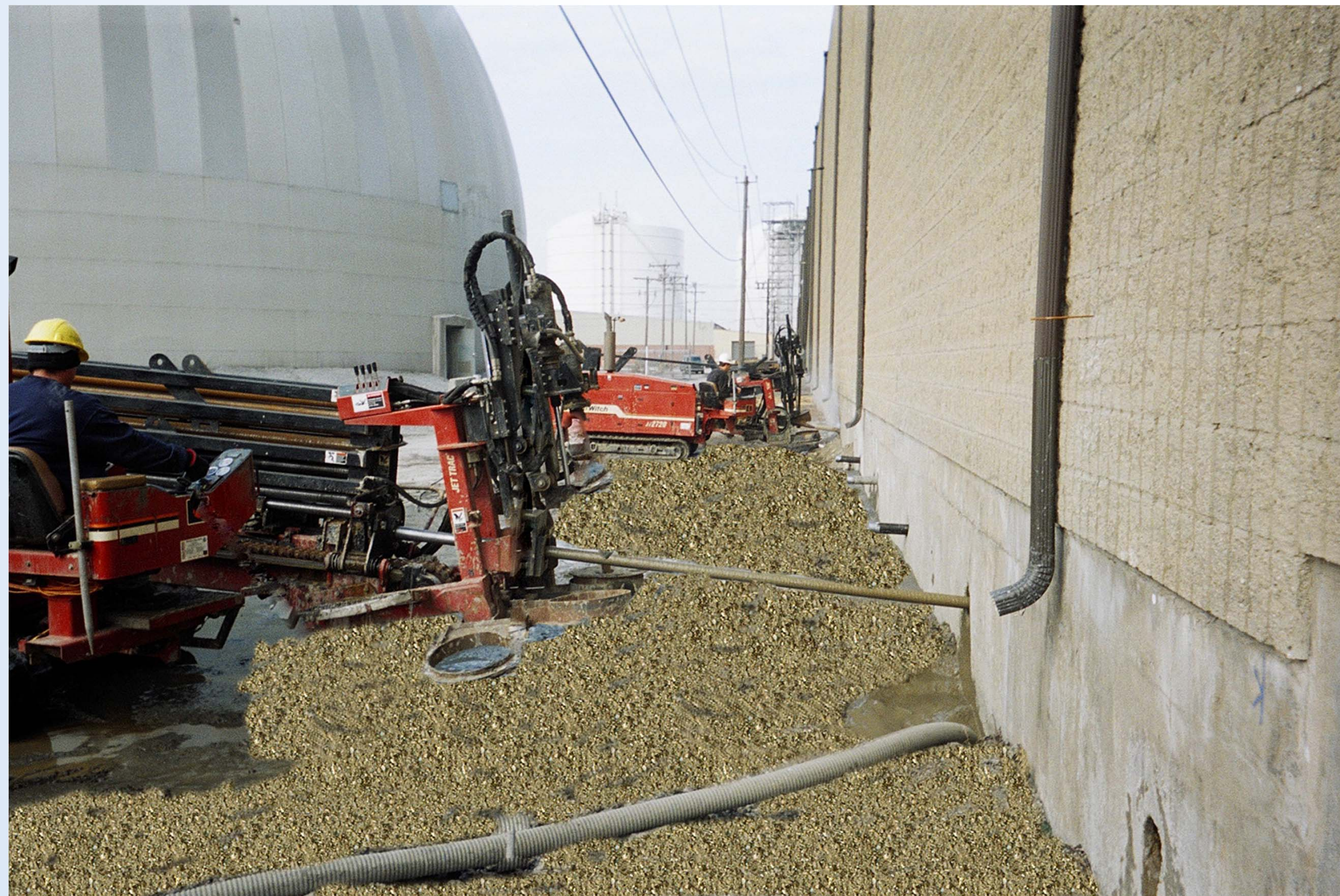
Horizontal Wells for Vapor Mitigation Installed Outside Building

Regulators mandated groundwater and soil sampling beneath a pharmaceutical manufacturer's building to address vapor intrusion (VI). Installation of vertical borings and wells was not feasible without disrupting manufacturing. Subsurface conditions beneath the building slab were unknown. Sub-slab soil and groundwater monitoring along with soil vapor extraction (SVE) for sub-slab depressurization (SSD) was completed with horizontal directional drilling (HDD) technology.