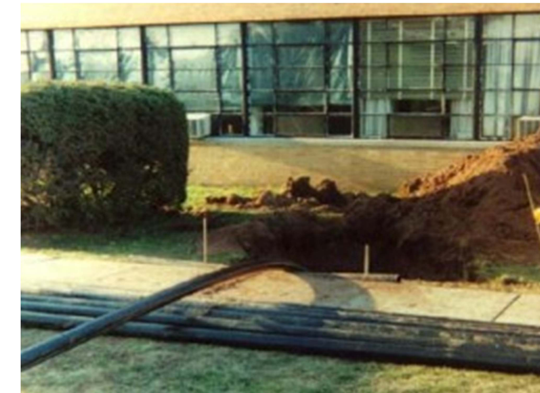
Example: Horizontal Wells for Vapor Mitigation with 3-inch HDPE Installed Outside Building